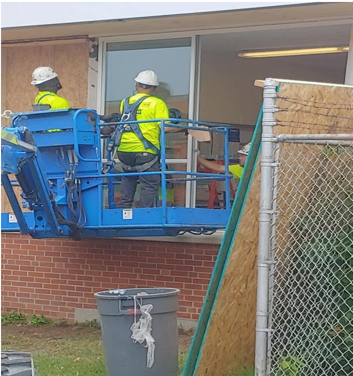
The Towns of Athol and Royalston invest in Athol High School by replacing the boiler system, school doors, windows and phones.